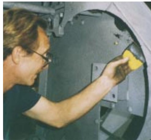
Plastic Steel, the first metal fortified epoxy repair compound is still one of the most effective for a wide range of general metal repair and rebuilding applications.

Aluminium filled, high strength bonding, patching and sealing paste that bonds to Aluminium and other metals, ceramics, wood, concrete or glass. Fasmatal 10 is ideally suited for air conditioning repairs.