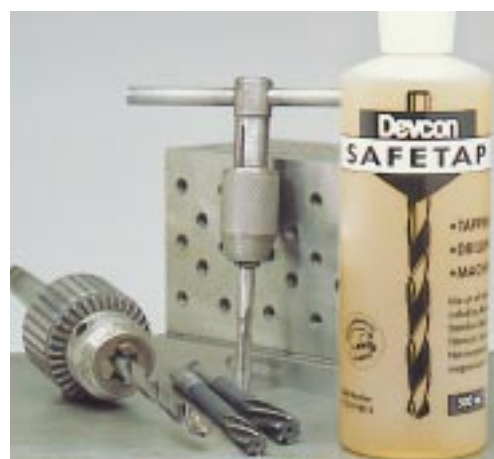
Safetap liquid - helping you work with metals and plastics safely.