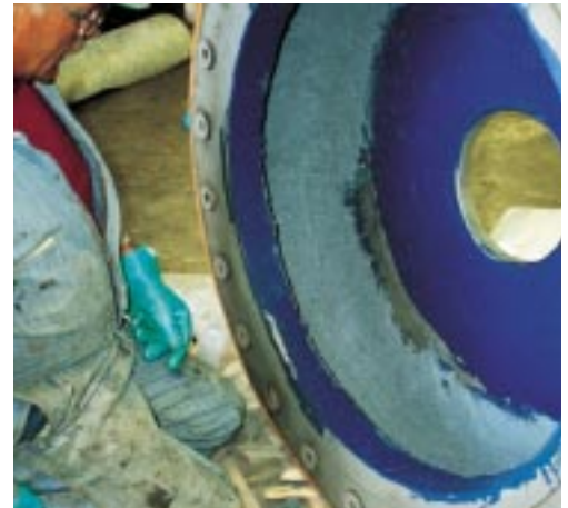
Wear Guard High Load offers an economical way to protect equipment surfaces from abrasion damage caused by particulate greater than 3mm.