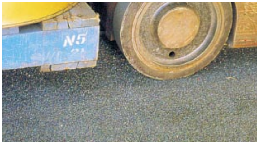
Devcon's Floor Grip Anti Skid provides a durable, non-slip surface on steel, wood or concrete, and is impervious to most liquid spills.

This durable epoxy can be used on steel, wood or concrete and produces a long lasting anti-skid surface for floors, ramps, stairs, catwalks, loading docks or anywhere a safety hazard exists. Floor Grip is easily applied by brush or roller and carbide granules are sprinkled over to provide a superb non slip finish. It is impervious to water, weather, oils, petrol and most chemicals and cures as low as 4°C.