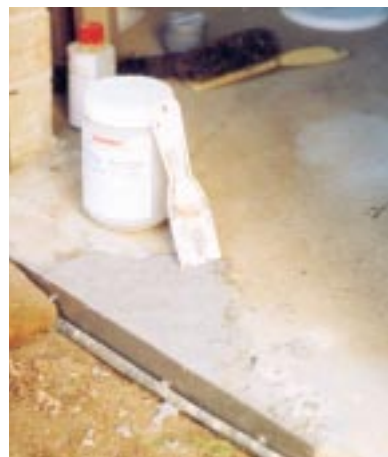
Floor Patch is easily applied and can be coloured to match the surrounding surface.