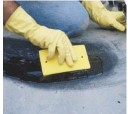
Use Flexane Putty to repair conveyor belts and rolls. It can also be trowelled on equipment surfaces to dampen sound and reduce vibration.

DEVCON Flexane Urethane Compounds are the toughest, most durable group of room temperature curing urethanes available to industry. These two component systems are available in putty and liquid form with a choice of engineered performance characteristics for protecting equipment against abrasion, impact and noise control and for casting custom rubber parts and low cost moulds. Flexane Liquid urethanes are widely used to make cost effective, non damaging holding fixtures, ultrasonic welding nests, punch dies and in combination with putties repairs with a smooth, waterproof sealing coat. (For further technical information refer to Technical Data section.)