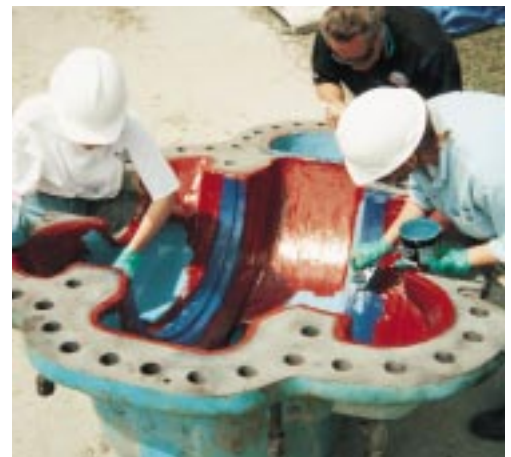
Brushable Ceramic provides pumps and other equipment with a smooth protective barrier against wear, abrasion, corrosion, erosion and chemical, attack, and it fills holes and voids in castings.