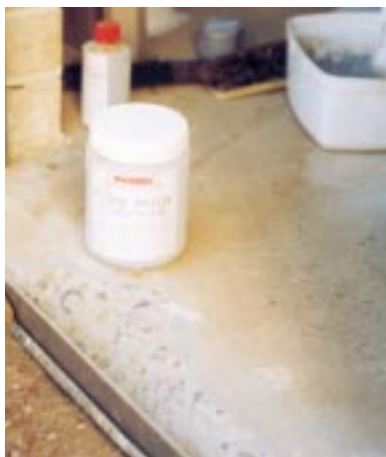
Remove all loose material and provide shoring to shape the repair by Floor Patch

This extremely versatile and high performance product has approximately three times the compression strength of concrete. It can be used to resurface old or new concrete, sealing masonry walls, excellent for filling old anchor bolt holes or anchoring machinery in concrete or masonry as it is non shrinking and non sagging. Floor Patch has good impact strength and resistance to oils, petrol, water, alkalis and acids. Sets quickly and cures overnight.