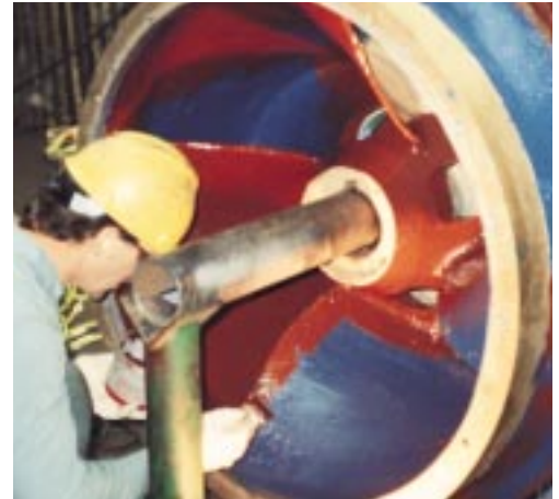
Ceramic Repair Putty protects equipment surfaces from damage due to wear and abrasion, extending service life and often eliminating the cost of replacement.

Sprayable Ceramic is a ceramic-reinforced composite that can be sprayed in a manner similar to high-solids paints. It is ideal for protecting pumps, pump pads, paper machines, stacks, steel frames and tanks. Sprayable Ceramic exhibits excellent chemical resistance and is available in a red or blue colour. Sprayable Ceramic uses standard airless equipment and is capable of being sprayed on in a thickness of between 400 and up to 600µm in one pass.