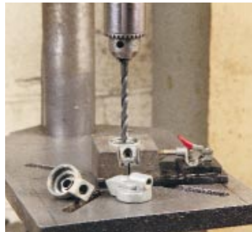
Plastic Steel Liquid offers a fast and economical way of making holding fixtures