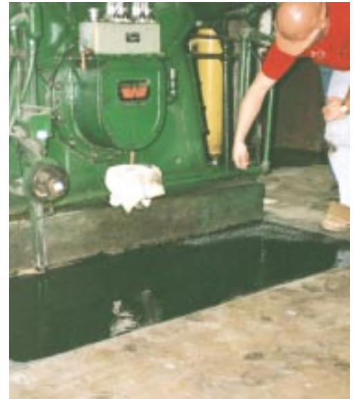
Devcon's Floor Grip provides a durable anti-skid surface for a safer environment in the vicinity of machinery and other equipment that tends to leak oil or other fluids.