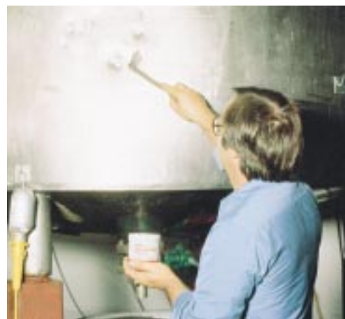
Stainless Steel Putty is ideal for making non-rusting repairs to stainless steel food processing equipment.