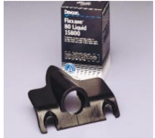
Use Flexane Liquids to mould small, quantities of rubber parts easily and economically.

Liquid version of Flexane 80 Putty. Castable, non shrinking, urethane compound for making rugged, flexible moulds, forming dies, cast parts, non scratching holding fixtures and abrasion-noise resistant linings. Flexane 80 Liquid makes precision moulds that faithfully reproduce detail, will not change shape while curing, returns to original shape after 350% elongation and has a 10 hour demoulding time. Flexane primers are recommended for maximum adhesion to metal, wood and concrete surfaces.