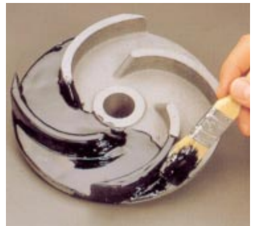
Flexane Brushable is an easily applicable finish that will protect your equipment from wear and corrosion

High performance, brushable urethane coating that cures to a medium hard rubber, Shore A 86 hardness, for protection against wear due to abrasion and impact. Having outstanding tensile strength and very good chemical resistance, this product is excellent for lining and protecting hoppers, chutes, pump impellers, feeder bowls and fans. Flexane primers are recommended for maximum adhesion to metal, wood and concrete surfaces.