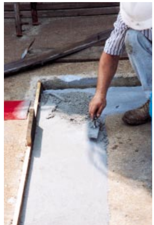
Floor Patch is also ideal for doing larger repairs.