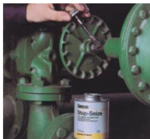
Threaded fittings are protected against sealing and locking with Stop Seize high temperature lubricant.